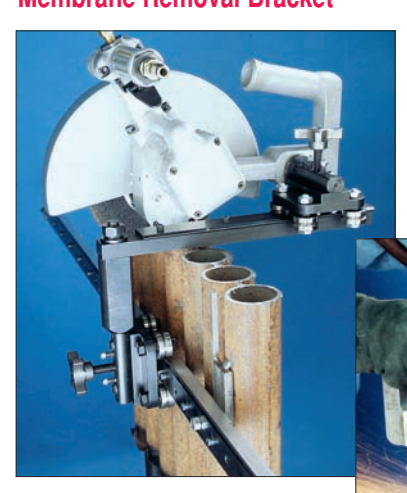
This bracket mounts right onto the EscoTrack to let you easily remove membrane from between boiler tubes.