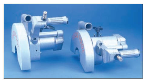
Standard APS-438 and Low Profile APS-438LP

The MILLHOG<sup>®</sup> Universal Air Powered Saw APS-438 is the complete, all around maintenance tool. Effortlessly gliding along the 5 ft. steel EscoTrack System, which attaches to a boiler tube panel section using two weld tabs, this powerful saw makes both horizontal and vertical cuts. After completing a horizontal cut, all you have to do for membrane removal is either remove the saw, rotate it 90° and reinstall it on the track, or for even faster membrane notching use the membrane removal bracket. This system is faster and safer than torch cutting and there is no heat affected zone or further rework needed before end prepping.