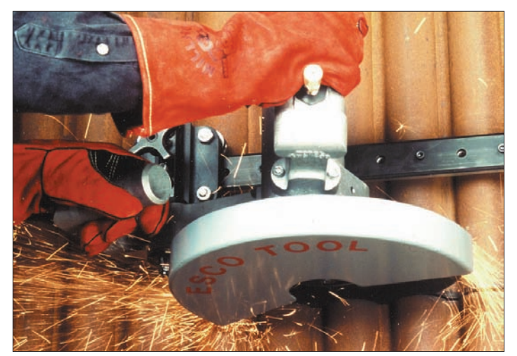
The PANELHOG<sup>®</sup> APS-438 Air Powered Saw glides along the EscoTrack System for boiler tube panel removal, producing a straight, clean horizontal cut that requires no further rework.